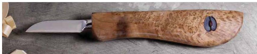
Big Detail Carver - Figured 1-3/4" Blade

This bird is meant to be carved as a smoothie, not requiring any woodburning or paint. Sand your bird to a 400 grit or more, then #000 steel wool. Apply a wax finish and buff with a clean cotton rag.