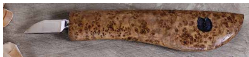
Detail Carver - Figured 1" Blade