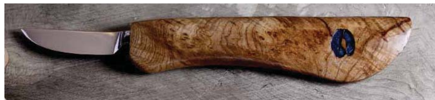
General Carver - Figured 1-3/4" Blade