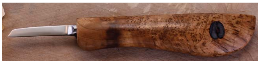
Draper Detailer - Figured 1-5/8" Blade