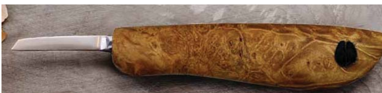
Draper Detailer- Figured 1- 5/8" Blade

I then used an antiquing gel to give him and overall 'dirty' look.