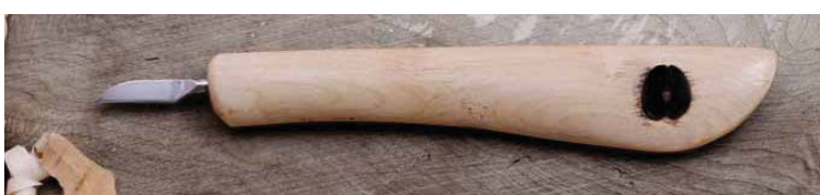
String Beaner - Plain 3/4" Blade